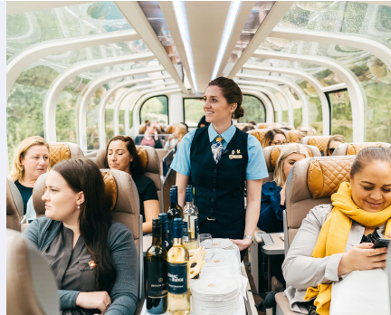
Complimentary Wine & Cheese