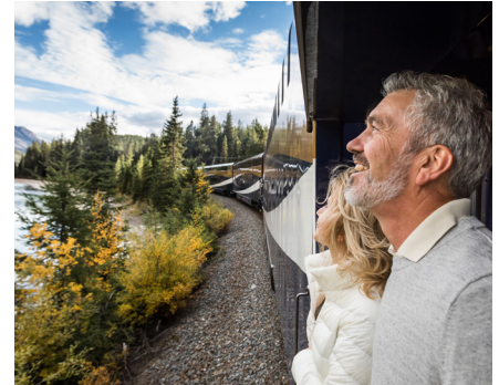
Exclusive Outdoor Viewing Platform