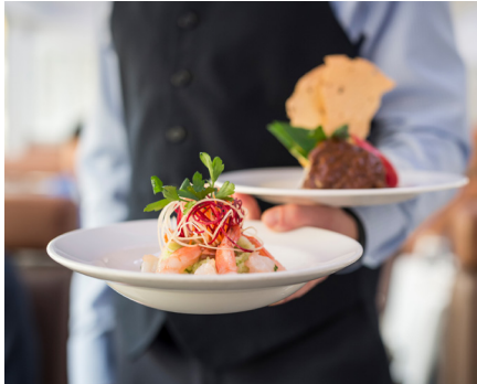
Gourmet Food crafted by Signature Chefs